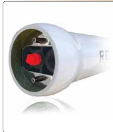
Low Pressure Vessel

The ROPV R40E series model accommodates standard make 4" membrane filtration elements. Manufactured to very exacting specifications with only the highest quality materials for continuous use. Our pressure vessels operate within a temperature range of 14–150°F (-10–66°C), at operating pressures of up to 1,200 PSI / 83 Bar. Individual units are hydro-tested prior to shipment to ensure only the highest quality and stable performance.